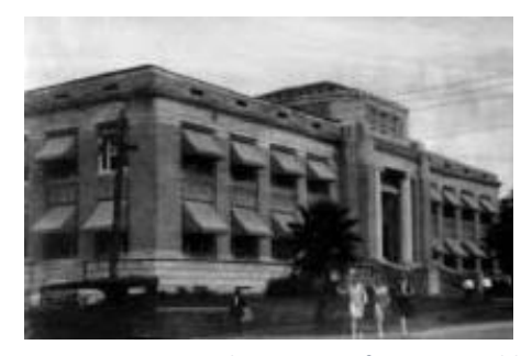
Figure 1. This picture of Martin Building was taken in 1929.

In 1927, the Florida Legislature took the license plate and title functions from the Comptroller and created the Office of the Motor Vehicle Commissioner who was appointed by the governor for a four-year term. The Governor named the inspectors and designated the license plate agents for the counties. The new state motor vehicle department was moved to the newly constructed, Martin Building on October 1, 1927 (Figure 1). The 24th Governor, John Martin, appointed W.F. Allen, mayor of Titusville, to be motor