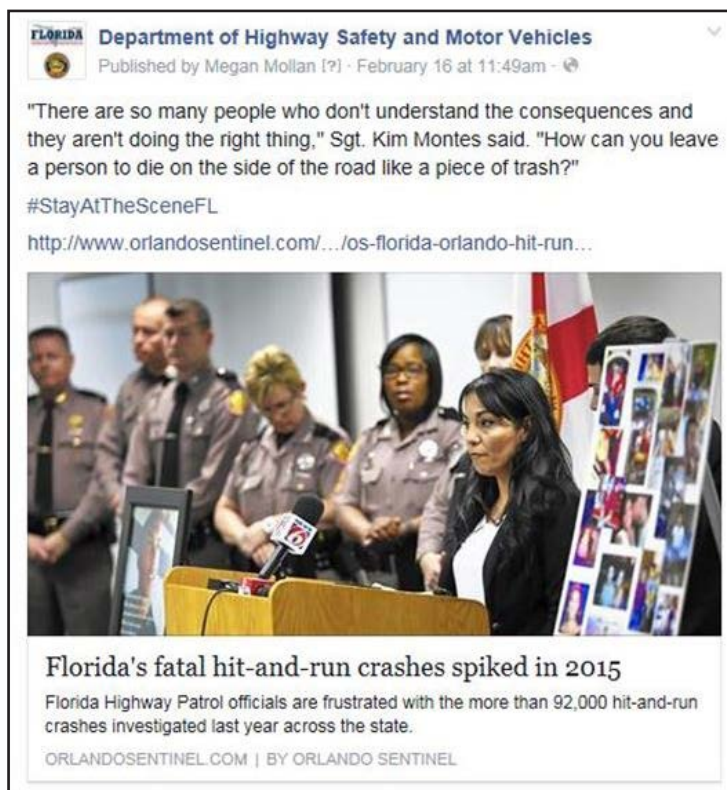
Figure 1: 15 Comments; 102 Likes; 29 Shares