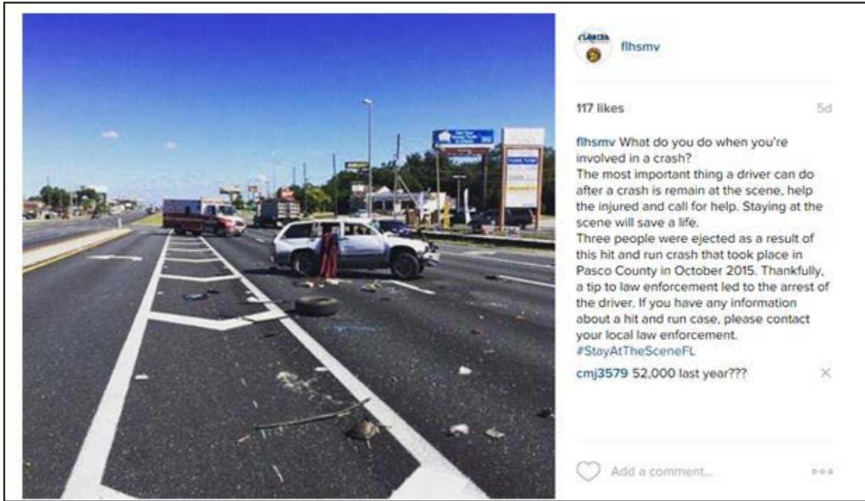
Figure 4: 115 Likes; 1 Comment

The department made five Instagram posts that contained Hit & Run Awareness Week content in February 2016, all of which received more than 60 likes and averaged 79 likes. The top Instagram post was the Pasco County hit and run car crash posted on February 19, 2016. This post received 115 likes.