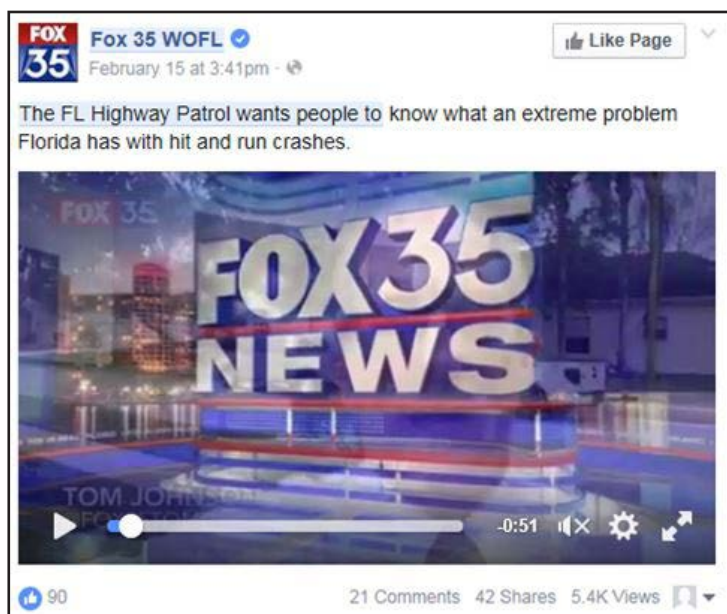
Figure 2: 21 Comments; 90 Likes; 42 Shares

In addition to department page and post data, there were more than 30 unique Facebook posts regarding the Hit & Run Awareness Week campaign. In particular, a Fox 35 WOFL post that included Hit & Run Awareness Week content received 5,400 views, 21 comments, 90 likes and 42 shares.